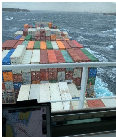
Figure 2 - OOCL TEXAS became the first vessel to use NCOS ONLINE on its transit into Port Botany

On 22 August 2019 at 1400 hours, despite heavy seas exceeding 6 m offshore and gale-force winds, PANSW successfully brought the container vessel OOCL Texas through the Heads and into Port Botany using the newly installed NCOS ONLINE system. The transit was considered groundbreaking as it would not have been possible using previous port regulations. Since then NCOS ONLINE has deferred extensive transit delays during storm events and has overall increased safe transit windows by more than 130% over the last 12 months.