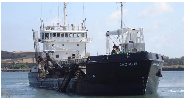
Figure 1 - The David Allan trailing suction hopper dredger

Continual maintenance dredging is required within the port to ensure safe navigation. It is fundamental to the continued operation and viability of the port. Dredging commenced in the port in 1859 and has been virtually continuous since that time. Maintenance dredging is carried out by a trailing suction hopper dredger (TSHD), the 'David Allan', which is owned and operated by the Port of Newcastle (Figure 1).