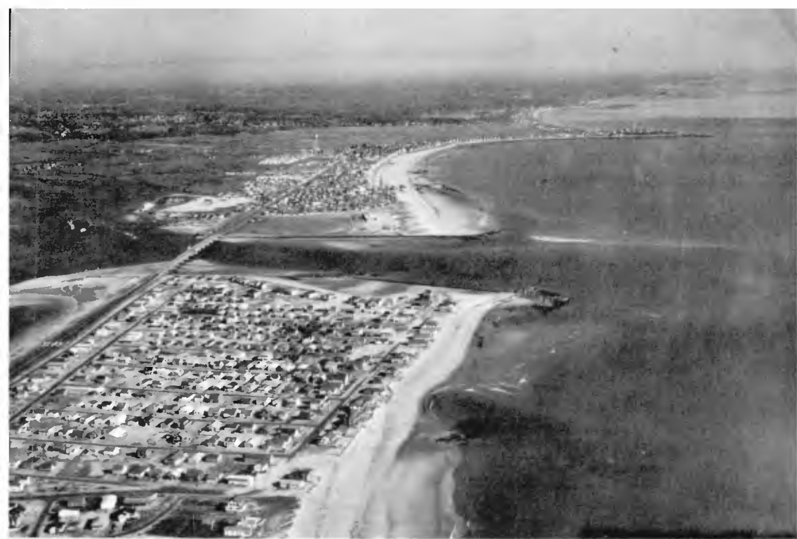
Hampton Harbor, New Hampshire