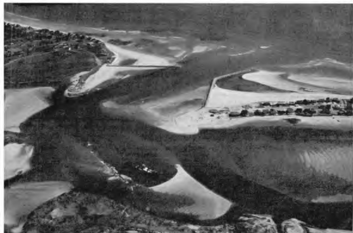
Webhannet River, Maine