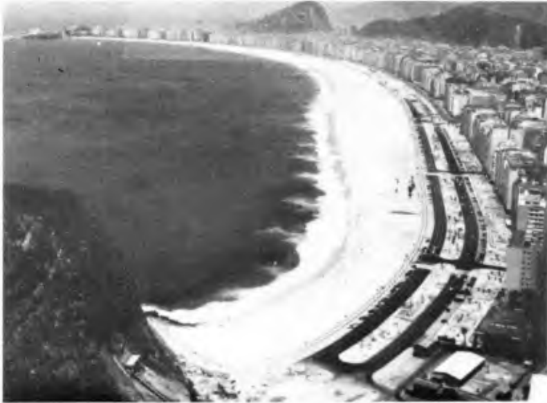
FIG. 7 - View of the beach one year after beginning of nourishment