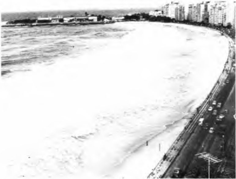
FIG. 3 - Effects of Storm Waves