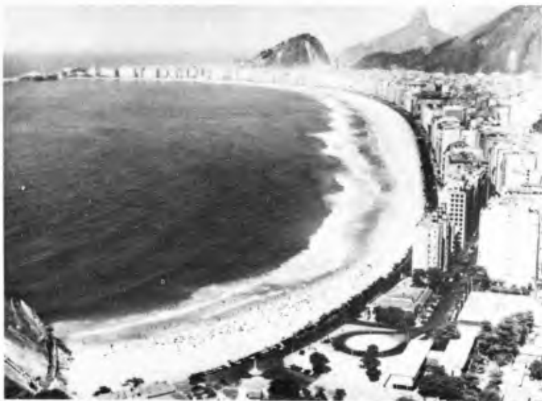
FIG. 6 - View of the Beach before Nourishment

While more experience is not achieved on the offshore dumping method, it is advisable to use it in combination with other methods whose efficacy is already well controlled.