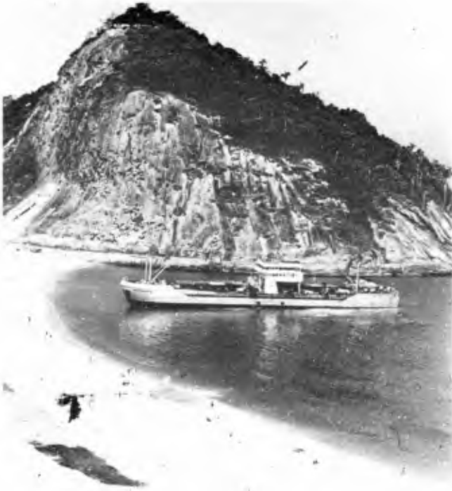
FIG. 4 - The Dredge dumping Sand

of pipes were connected in X, so that any of the two dredges could pump to any of the discharge points. The actual percentage of solids in the solid-liquid mixture was about 12.5 %. During the operation the 500 m floating pipeline was occasionally damaged by wave action, resulting breaking of ball-joints and collars. Also the spud of one of the dredges was once broken by wave action.