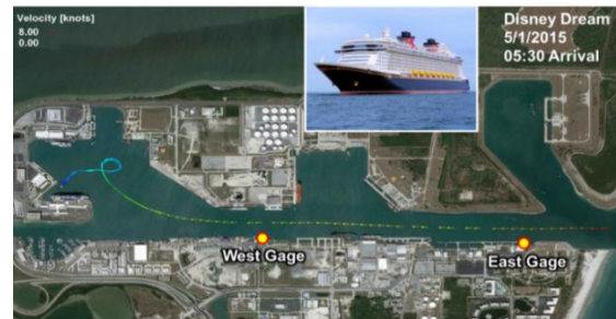
Figure 1 - AIS Data used to complex ship-maneuvering inputs for VH-LU modeling system

Modeling results for both validation periods indicate that the VH-LU model was able to successfully reproduce the surge effects (i.e. water surface fluctuations) measured in the field, for a wide array of passing cruise ships. The validations showed that the model successfully reproduced the initial drawdown and surge, as well as the surge wave free propagation in the harbor and interaction between the Middle and Trident Basins of the harbor. The successful validation of the VH-LU model has built strong confidence in its application, which has been instrumental in understanding the potential changes in harbor conditions that may be generated during channel deepening or introduction of new vessels to the harbor.