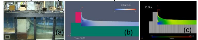
Figure 3 - Spatial waveform comparison of (a) experiment, (b) OpenFOAM and (c) CADMAS-SURF.

Preliminary studies show that the results of the interFoam and CADMAS-SURF with all turbulence models are in fairly well agreement with the experimental results along the wave channel. There are some discrepancies in the results in front of the vertical wall because of the extremely high splashes over the vertical wall. Figure 3 shows the spatial waveform comparison. Among all the models it is seen that the LES gives more accurate results both along the channel and on the vertical wall, yet, laminar flow assumption is also found to give acceptable results considering required engineering accuracy in comparison with computational time.