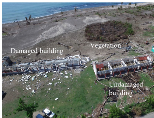
Figure 1 - Protection offered by vegetation during hurricane Matthew for nursing school buildings on a beach at Côteaux (Haiti).

Flooding events caused by hurricanes or tsunamis pose a substantial risk for the integrity of coastal infrastructures. The impact of such inundation events (IEs) greatly depends on the natural and anthropogenic disturbances, such as existing vegetation or neighboring structures. Figure 1 shows an example from hurricane Matthew (2016) from Kijewski-Correa et al. [2018].