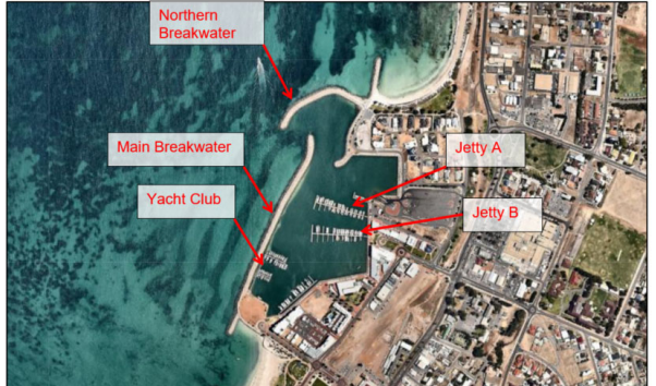
Figure 1 - Batavia Coast Marina

Batavia Coast Marina (BCM) in Geraldton, Midwest WA is one of 50 Department of Transport (DoT) coastal facilities spanning Western Australia from Wyndham to Esperance. Since construction of BCM was completed in 1995, there have been significant operability issues in the form of excessive motion of moored vessels, mooring line breakages, and damage to pens at the facility. This was in part addressed by the addition of the Northern Breakwater in 2000 as seen in Figure 1.