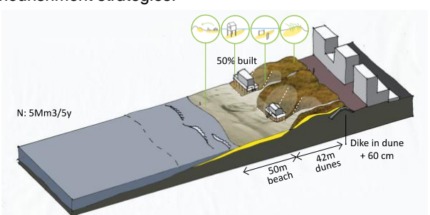
Figure 2 - Seaward sandy strategy for Noordwijk following regular nourishment, applying aeolian principles to stimulate dune formation, including urban (re)configuration.

Depending on the objectives of the nourishments, urban and ecological interventions can be made to direct the location of dune formation following nourishment. Examples of optimized spatial arrangements for BwN in time, employing the developed principles, are given by two Dutch case-studies: A) mega-nourishment Sand Motor at the Delfland coast with a vast, rural, high dynamic profile: and B) the coastal resort of Noordwijk with a compact, high urban, low dynamic profile and a seaside boulevard typology. In the Noordwijk case an increased sea level scenario of + 85cm in NL 2100 has been applied to see how much sandy reinforcement of the current profile is needed. This relates to different nourishment volumes (Stronkhorst et al., 2017) and can result in alternative coastal profiles. Urban implications of both coastal profiles are discussed, to show if and how multiple use of the coastal buffer can be made compatible with wind-driven dune formation processes. Conclusions reflect on the effectivity of BwN approaches regarding different coastal settings (urban, high dynamic) and the scaling up of urban interventions in combination with nourishment strategies.