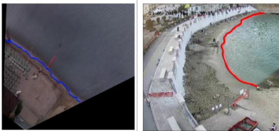
Fig. 1 - Automatic detection of the shoreline at Riccione (left) and Monopoli (right).

In the framework of the STIMARE Project (Archetti et al., 2019), low-cost video monitoring techniques are implemented in order to quantify the coastal erosion and flooding area through automatic and in real-time image processing of the shoreline evolution and get data to calibrate numerical models.