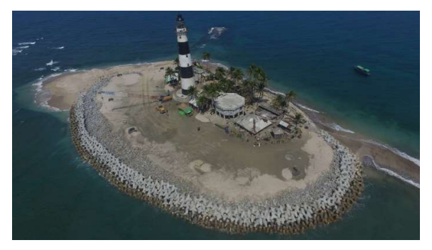
Figure 4: Mayu Island after the construction.

The project is finished on March, 2020. It is expected to protect the island from removal of sands by wave attacks. The Figure 4 depicts the situation immediately after the construction.