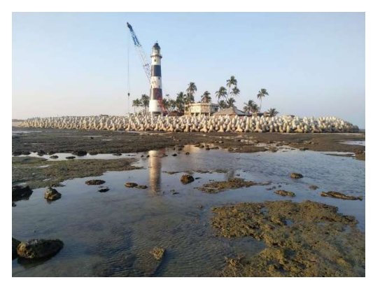
Figure 3: Mile slope of the Island exposed during the low tide.

During the project implementation, technical challenges were encountered such as the tidal window and weather conditions causing the operation downtime. As shown in the Figure 3, the mild slope of the island exposed during the low tide hinders the barge that transports the tetrapods. Moreover, the severe weather conditions delay the construction phase. It is, therefore, crucial to be aware of environmental conditions and tidal situations such that the project should be realized in the planned time frame.