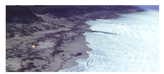
Figure 2 - Runup at the FRF during Hurricane Dorian.