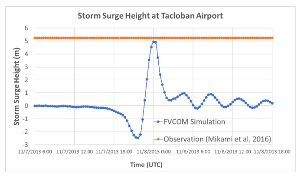
Figure 2 - Validation of Storm Surge at Tacloban Airport

calculated based on the tsunami load provisions of the ASCE 7-16 Standard.