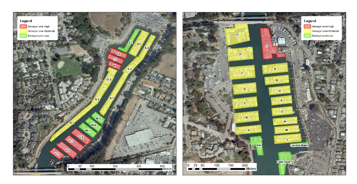
Figure 2. Damage survey of the Santa Cruz Harbor north (left) and south (right) basins showing areas of high (red), medium (yellow) and low (green) slip damage.

The north harbor sustained the most severe damage during the tsunami event. The damage within the basin however, was spatially heterogeneous with some areas experiencing little or no impacts while other docks were destroyed. Docks W-1, W-2 and W-3 sustained no damage during the tsunami event and are shown in green. Docks U-1, U-2, V-1 and V-2 sustained a high degree of damage and are shown in red. Eyewitness accounts have indicated that damage at these docks occurred early in the tsunami event. Docks H, I-1 and I-2 also sustained a high degree of damage. However, these docks were damaged by debris which had accumulated within the harbor as a result of the initial waves. This type of damage is considered beyond the scope of this study.