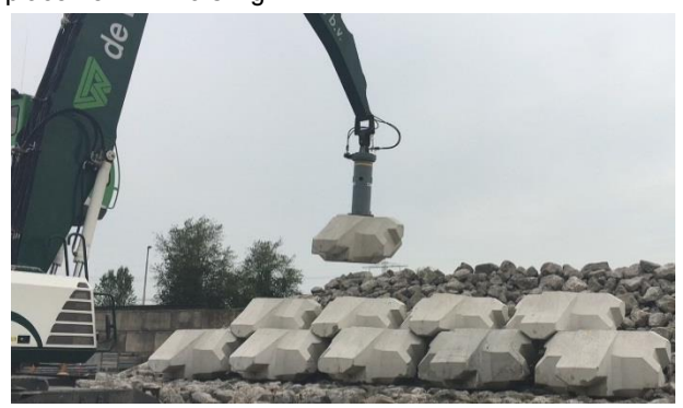
Figure 4: Placement of 6.5ton XblocPlus

The XblocPlus contains a hole in the main body which reduces wave pressure. This hole is used for fast and very efficient placement with a clamp. Placement rates with this method are significantly higher than conventional placement with a sling.