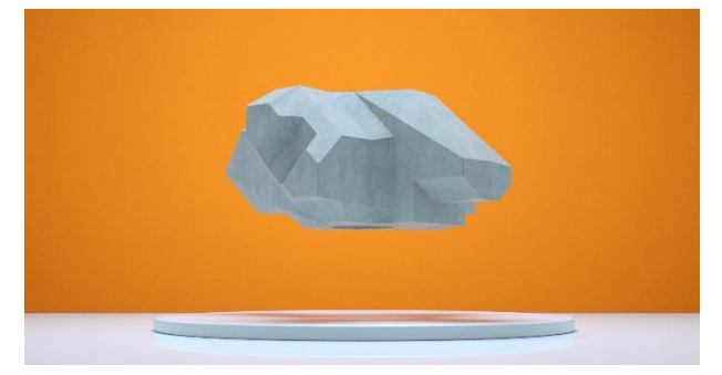
Figure 1: XblocPlus shape

The result is the XblocPlus which is shown in Figure 1.