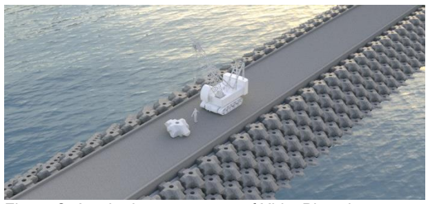
Figure 2: Aesthetic appearance of XblocPlus slope

Due to the lower stability number chosen, an XblocPlus will be larger than an Xbloc or Accropode-II for the same design wave height.