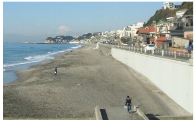
Figure 2 - Reconstructed Section of Seawall of Route 134 in Kamakura, Japan

the beach area by 1,660 square meters (17,800 square feet), the new vertical pipe pile seawall allowed removal of the slope portion of the existing concrete seawall, increasing the beach area by 723 square meters (7,770 square feet). The native vegetation on the beach was carefully monitored and restored during and after the construction.