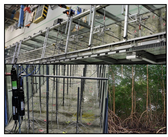
Figure 1 - Model mangrove forest (top and left bottom panel) and real mangrove forest (right bottom panel).

Free surface measurements reveal wave height attenuations up to 55% of the incident wave height for the smallest water depth (e.g. Figure 2) and a free surface gradient up to 200% for the same water depth and the highest unidirectional flow velocity. Flow attenuation strongly depends on water depth, highlighting the importance of the variable frontal area characteristic of this type of mangroves. Forces exerted on the mangroves exhibit the highest values at the first 5 rows and they are dependent of frontal area variability in agreement to Maza et al. (2017).