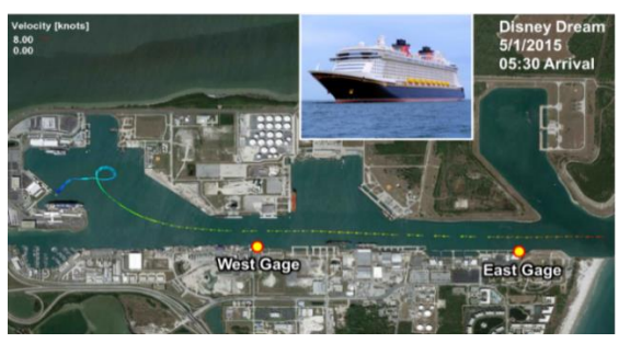
Figure 1 - AIS Data used to complex ship-maneuvering inputs for VH-LU modeling system

Modeling results for both validation periods indicate that the VH-LU model was able to successfully reproduce the surge effects (i.e. water surface fluctuations) measured in the field, for a wide array of passing cruise ships. The validations showed that the model successfully reproduced the initial drawdown and surge, as well as the surge wave free propagation in the harbor and interaction between the Middle and Trident Basis of the harbor. The successful validation of the VH-LU model has built strong confidence in its application, which has been instrumental in understanding the potential changes in harbor conditions that may be generated during channel deepening or introduction of new vessels to the harbor.