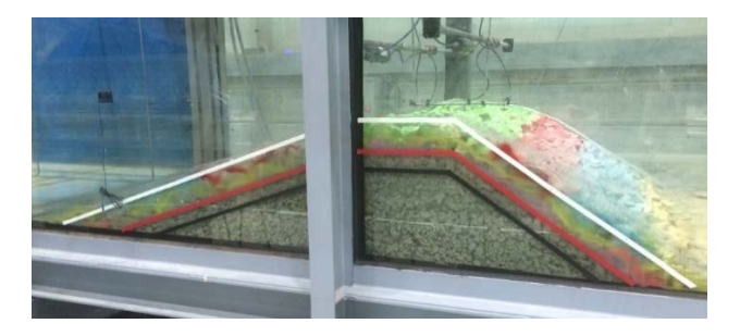
Figure 2.Lateral view of rubble-mound breakwater without crown wall

freeboard (Fn) and number of waves (N) have been calculated for the two tested RMBs, and a separate analysis has been accomplished for the seaside and the leeside slopes. After the damage analysis, several exponential fittings have been proposed for damage evolution of both slopes.