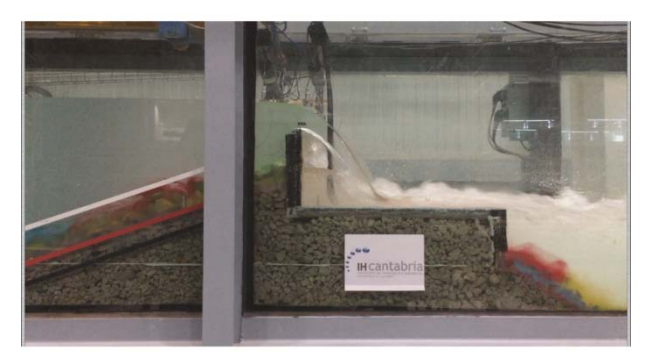
Figure 1. Overtopping over RMB with crown wall.

Tsunamis are relatively infrequent but very destructive phenomena that can cause devastating consequences on coastal areas. In view of recent tragic episodes, the scientific community is strengthening their efforts to develop strategies to mitigate the risk of tsunami consequences, specially focused on the potentially affected areas. One of the strategies in this direction is the design and construction of more efficient coastal structures. In this way, in the frame of the EU FP7 project ASTARTE physical experiments on rubble-mound breakwaters (RMB) under tsunami wave attack have been carried out in the IH Cantabria facilities in Santander, Spain. These experiments focused on gaining a better understanding of tsunami impacts on this kind of structures. Improving the knowledge about their stability and hydrodynamics will contribute to a better design of coastal protection marine structures.