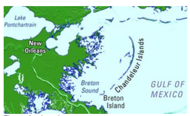
Figure 1 - Location

The product and purpose of a well-planned program of investigation and design will be realized later this year when restoration construction begins on North Breton Island. North Breton Island is the southern-most of a chain of barrier islands forming the Chandeleur Islands. The barrier island formation lies within the Mississippi River delta plain system approximately 62 miles southeast from the metropolitan city of New Orleans, LA (Figure 1). Under the authority of the Natural Resource Damage Assessment (NRDA) process, NRDA Trustees selected enhancement of North Breton Island as part of the 2014 Deepwater Horizon NRDA Phase III Early Restoration Plan to help restore injuries to natural resources (Trustees, 2014). The U.S. Fish and Wildlife Service (USFWS) is the lead implementing agency for this Project. The Project includes restoring the barrier shoreline along the entire length of North Breton Island through beach, dune, and marsh fill placement utilizing an offshore sand source in the Borrow Area located approximately 3.3 nautical miles (NM) east of the Restoration Area in the Gulf of Mexico.