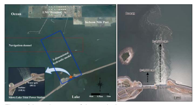
Figure 1 Location map of the study Area

data, on erosion and accretion phenomena due to strong flow velocity of discharge.