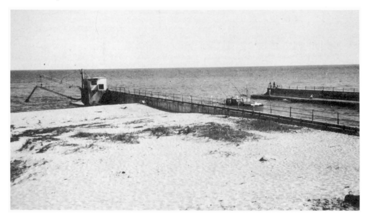
Fig. 3. Pumping plant near outer end of north jetty.

inlet on the bridge, is about 24 ft. above mean sea level. The line appears to flow full at the outfall during normal pumping rates (Fig. 4). The pump is rated to have a 135-ft. total dynamic head for normal operation, and pumps at a velocity of about 12 ft. per sec. with from 10 to 20 percent solids (by volume). The beach material is about 60 percent shell and about 40 percent medium to coarse sand. The consensus is that the pump places about 100 cubic yards of beach material per hour of normal operation.