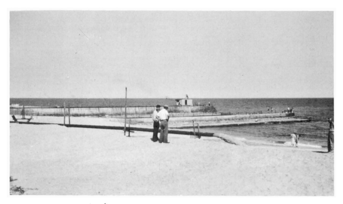
Fig. 4. Discharge line south of south jetty.